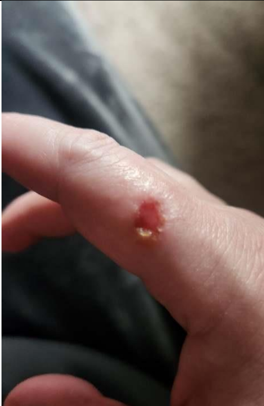
When it happened